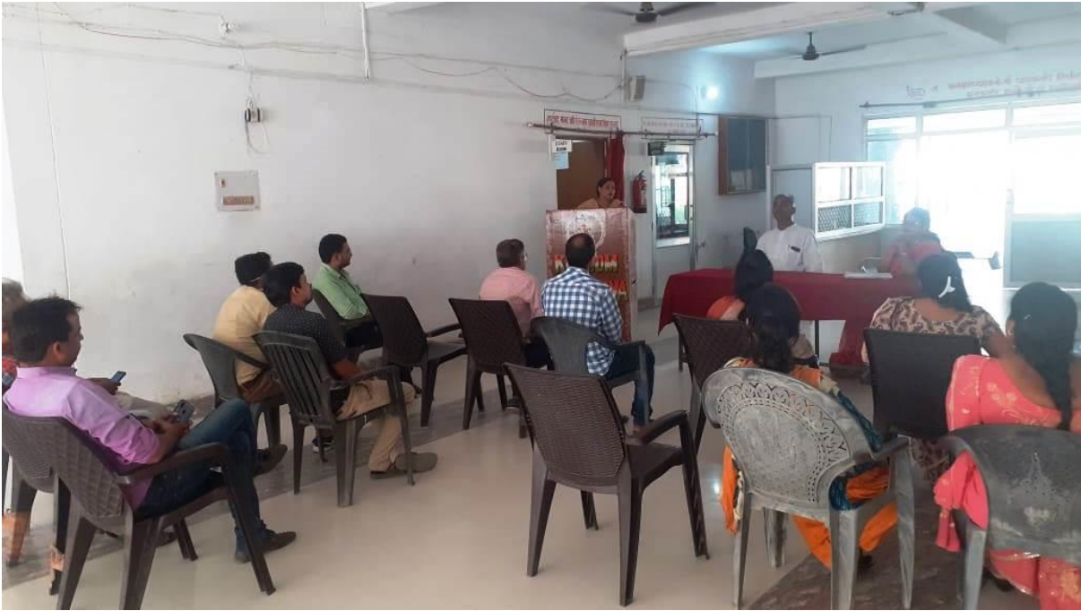
(School Staff during the Meeting)